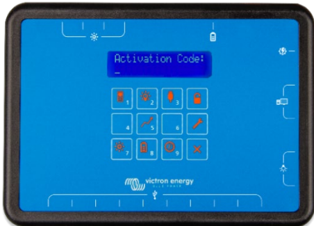
SHS 200 – Front view Keypad and LCD screen